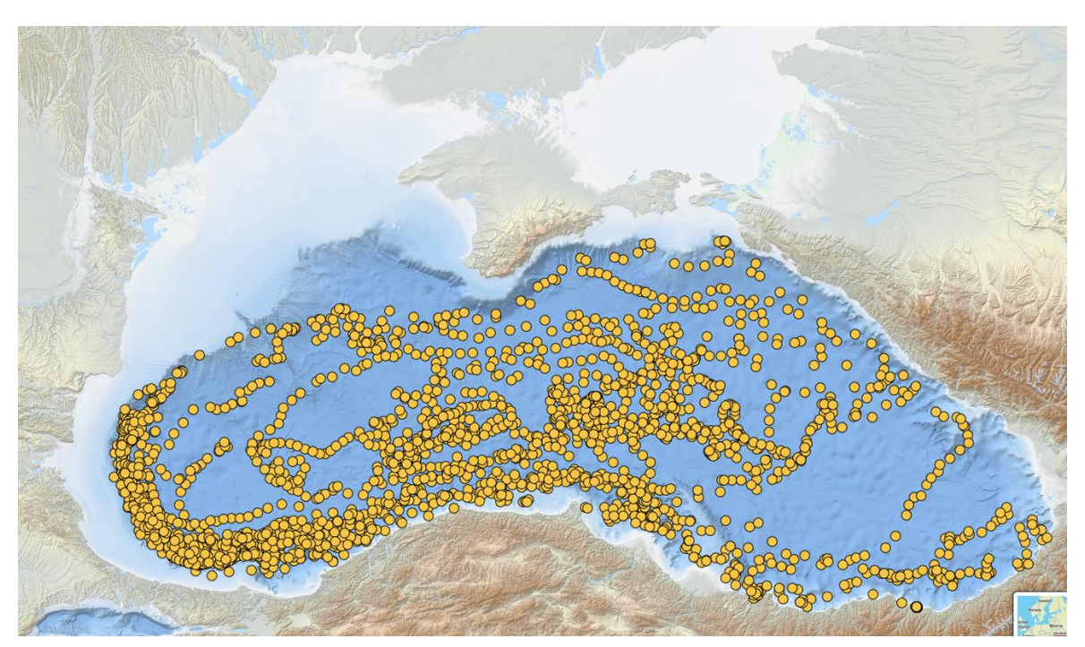
Figure 1. Profiles of the BulArgo floats

Since 2011 IO-BAS has deployed altogether 12 floats under the BulArgo programme, which is the Bulgarian contribution to the Euro-Argo ERIC infrastructure. The floats have provided more than 2200 T/S profiles (Fig.1). Currently the number of active floats in the Black Sea is 11 out of which 8 are operated by Bulgaria.